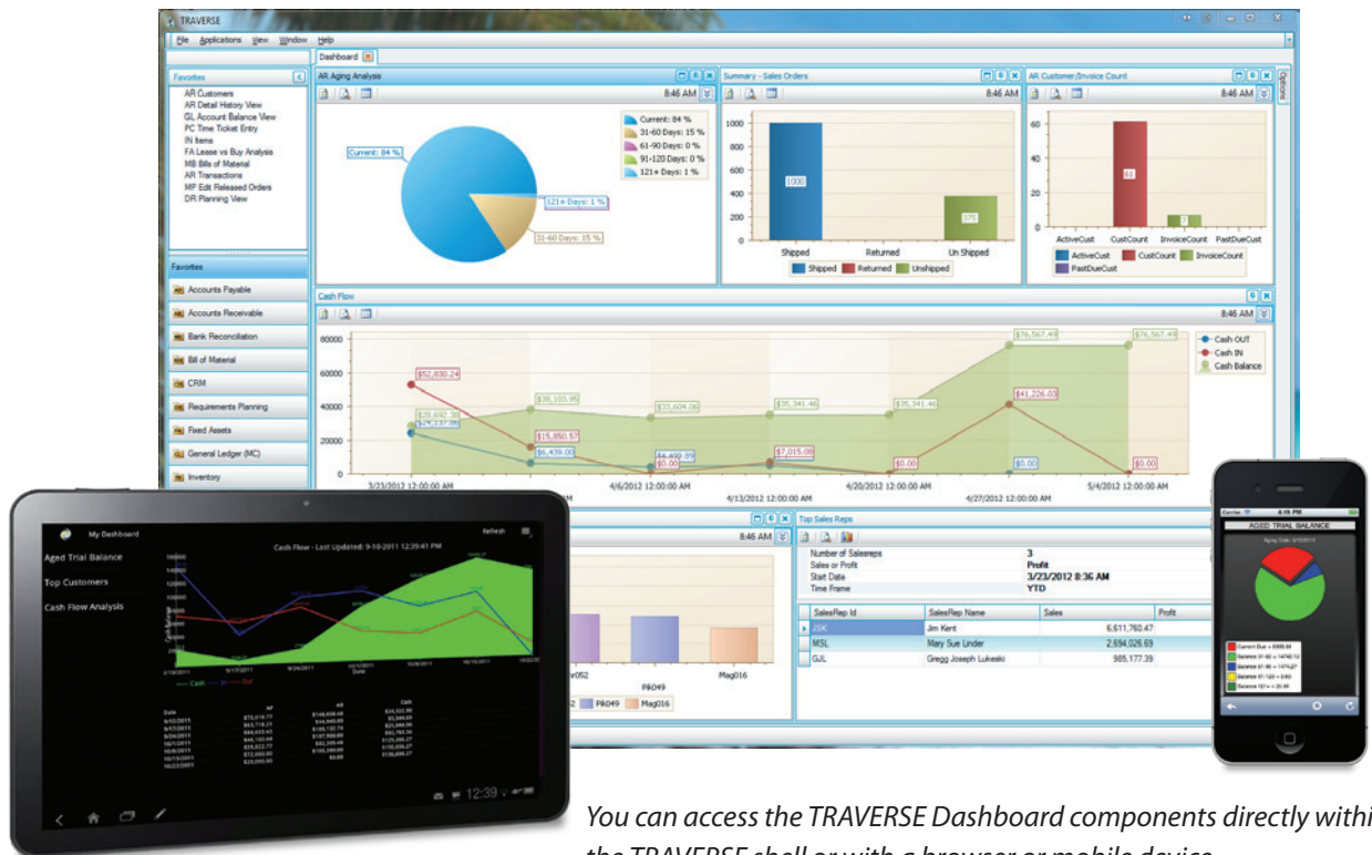
You can access the TRAVERSE Dashboard components directly within the TRAVERSE shell or with a browser or mobile device.

You can personalize your Dashboard by selecting and positioning the dashboard objects you want to see, configuring them to present precisely the information you need, and choosing to view the data in graphical form, in a data grid, or both. You can also set an automatic refresh interval to ensure that the data you see is timely and accurate.